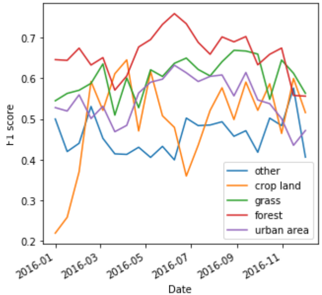
Figure 1: F1 scores from model trained and tested at the same date. Maximum values are used to compare results from first experiment.

The maximum F1 score from the experiment with the data set determined by temperature is better for all classes than the maximum F1 score from the second experiment (table 1). That means that the temperature helped us improve the classification.