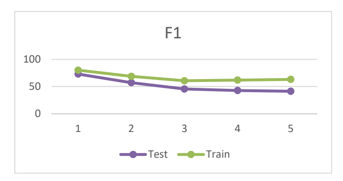
Figure 2: Graph of model performance (measured by F1, the higher the better) for test and train data and 5 slope differences.

We can see that the performance on the training and test set does not differ much on slope difference 1. As the slope difference increases, the performance on the test set drops relative to the performance on the training set.